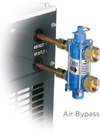
Air Bypass Valve