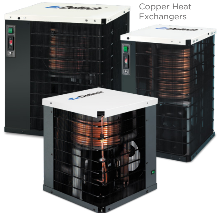
Efficient Smooth Copper Heat Exchangers

Customers around the world have relied on Deltech for great value in air treatment solutions. Deltech Refrigerated Dryers offer a simple solution based on a long history of industry leading technology.