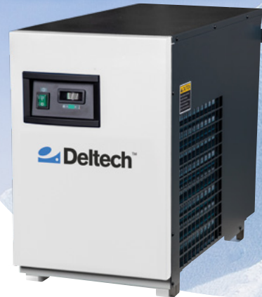
Model Shown Above: HPRN75