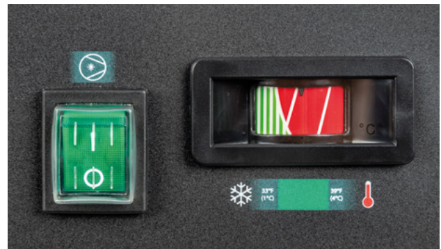
Controls: Models 75 - 150 scfm